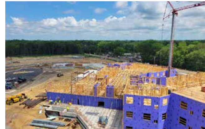
Much of June was spent framing and installing walls for the multilevel senior living building. By mid-July, work had begun on the roof parapet at the building's south end.