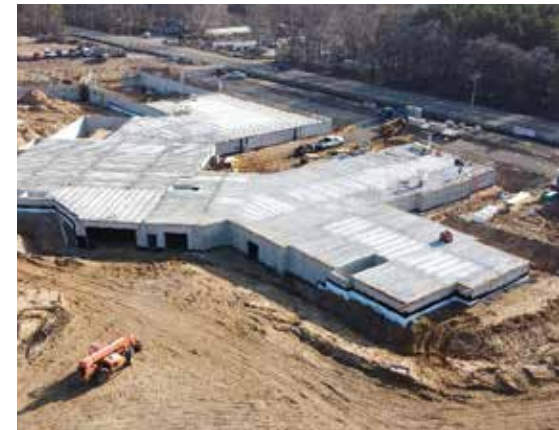
An aerial shot of the campus taken in early May after the site had been excavated and the footings and main level floor had been poured.