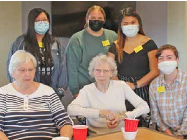
Serving root beer floats