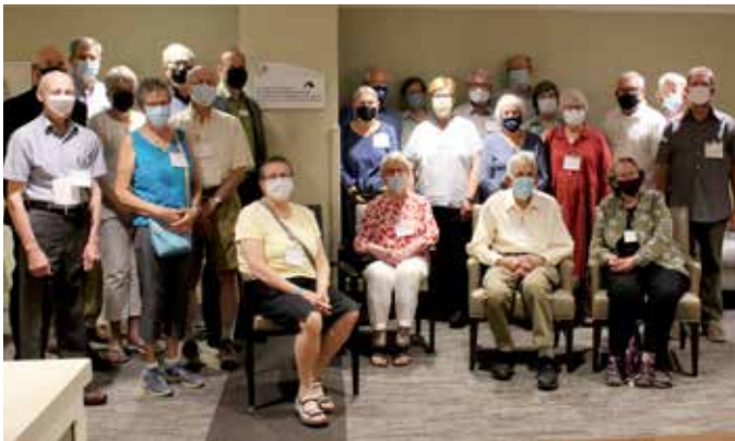
Members of St. Anthony Park Lutheran in St. Paul gather in the care center lobby, which was dedicated in their church's honor for their substantial donations to the Lyngblomsten Foundation.

Congregations that provided donations to the Lyngblomsten Foundation between January 1 and December 31, 2021.