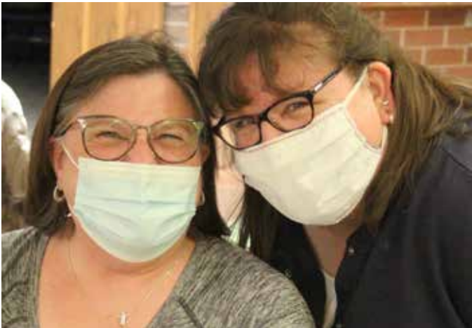
Sharing a smile