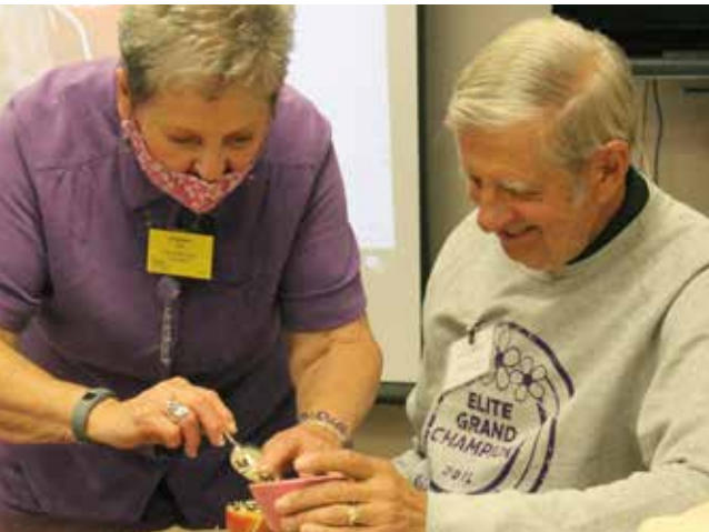
Assisting with activities at The Gathering