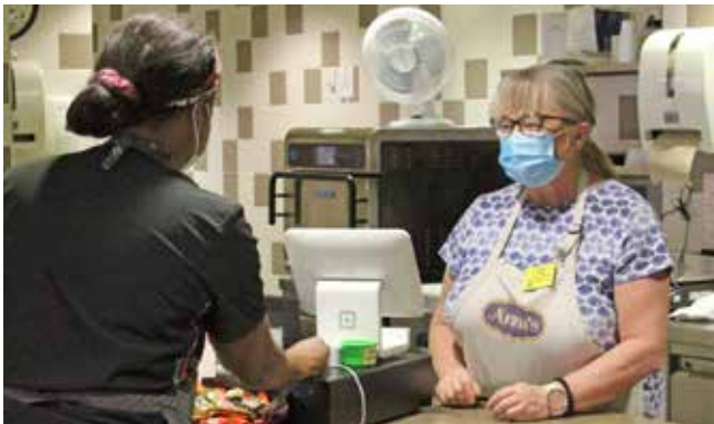
Cashiering at Anna's

Registered volunteers who served three or more years by December 31, 2021.