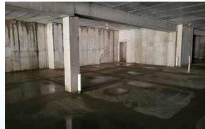
A view of the main building's basement after the concrete floor had been poured in late June. The basement will have underground parking spots for residents, along with a pet washing station, workshop, and production kitchen.