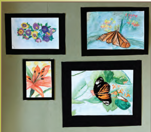
Watercolor class exhibit at the Tree Lighting Ceremony in December