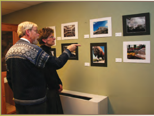
Photography 1,2,3! class exhibit at the Tree Lighting Ceremony in December