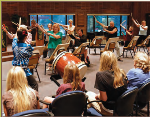
Taiko Drumming performance