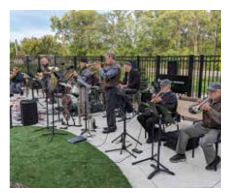
▲ Land O' Dixie entertains at the Grand Open House on October 7, 2023.