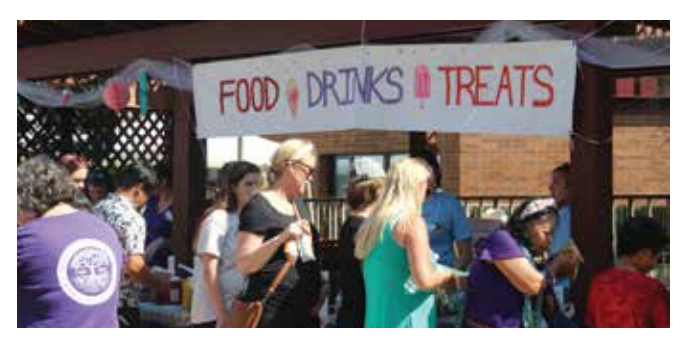
August An Ice Cream Social for the St. Paul campus included farm animals, games, music, hot dogs, and lots of ice cream!