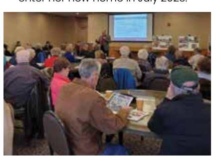
Sneak Peek information session in Shoreview in November 2019