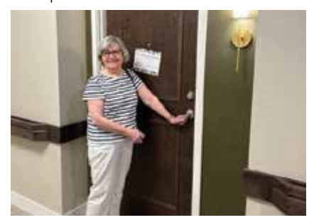
▲ One of the first residents about to enter her new home in July 2023.